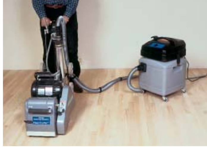
Easily adapts to belt or drum sanders for reduced airborne dust. Large 15-gallon tank holds more dust.