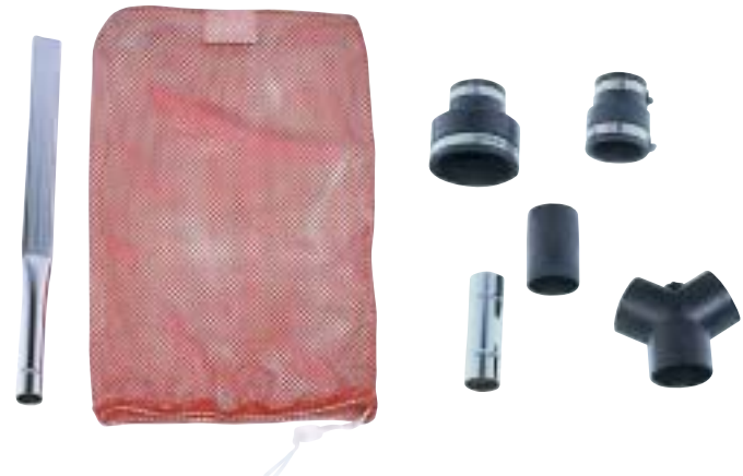
A wide range of performance enhancing accessories and options are available to make the job easier from start to finish.