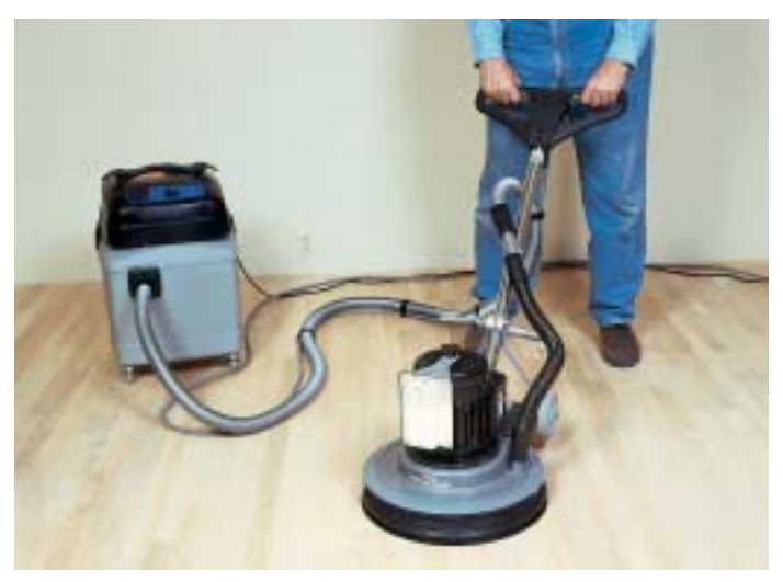
Combine the CAV-15 vacuum with the Sander 1600dc for ultimate experience in dustless sanding and screening.