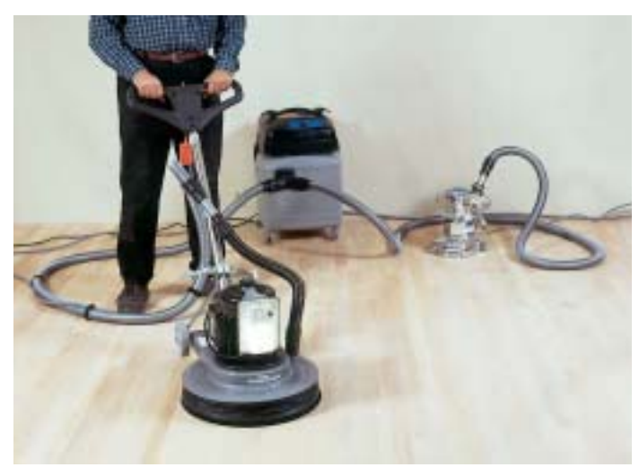
A complete system designed to be easily adapted for maximum dust control in multiple sanding tasks.