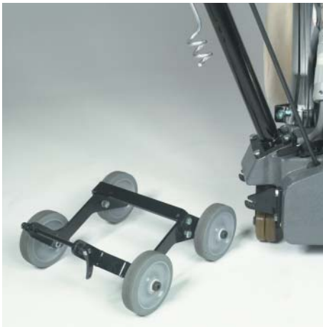
Patented Dolly Transport™ system eases transport to job sites