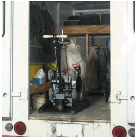
Unique transport platform bolts into vehicles for easy storage and transport