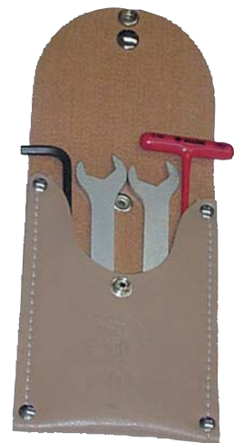
Exclusive tool set provides all tools needed for routine set up and adjustments